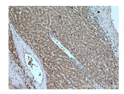
Immunohistochemical analysis of paraffinembedded human liver cancer tissue slide using 28363-1-AP (MAEA antibody) at dilution of 1:200 (under 10x lens). Heat mediated antigen retrieval with Tris-EDTA buffer (pH 9.0).

Various lysates were subjected to SDS PAGE followed by western blot with 28363-1-AP (MAEA antibody) at dilution of 1:2000 incubated at room temperature for 1.5 hours.