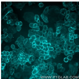
Live SKBR-3 cells immunostained with anti-HER2 (trastuzumab biosimilar) labeled with FlexAble Coralite Plus 405 Antibody Labeling Kit for Human IgG (KFA108). Epifluorescence images were acquired with a 20x objective and post-processed.