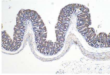
Immunohistochemical analysis of paraffin-embedded mouse colon tissue slide using KHC0128 (Cortactin IHC Kit).